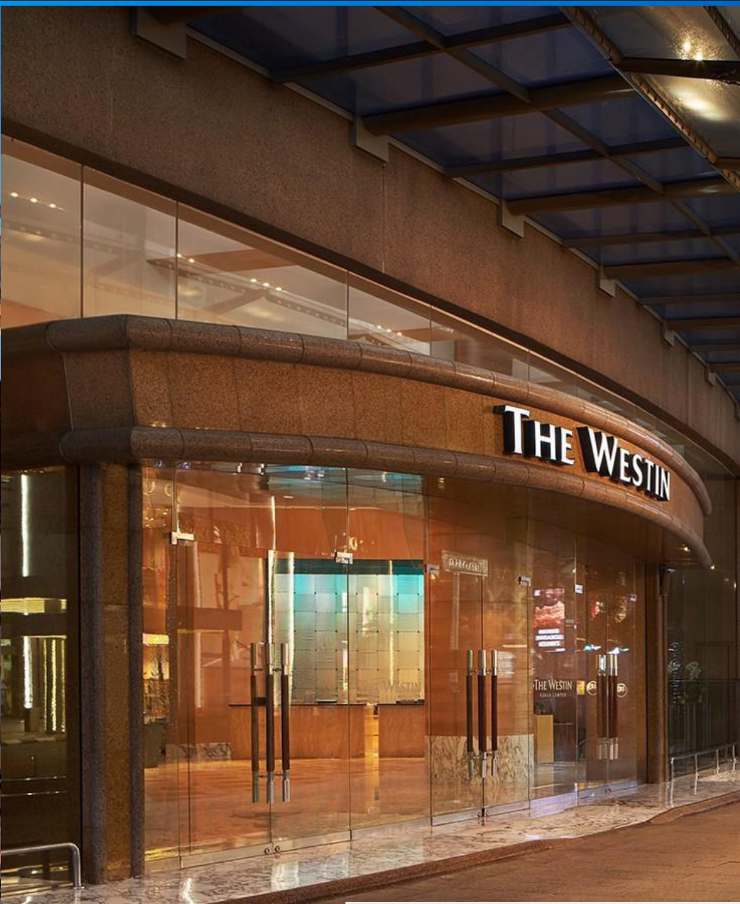
The Westin Kuala Lumpur