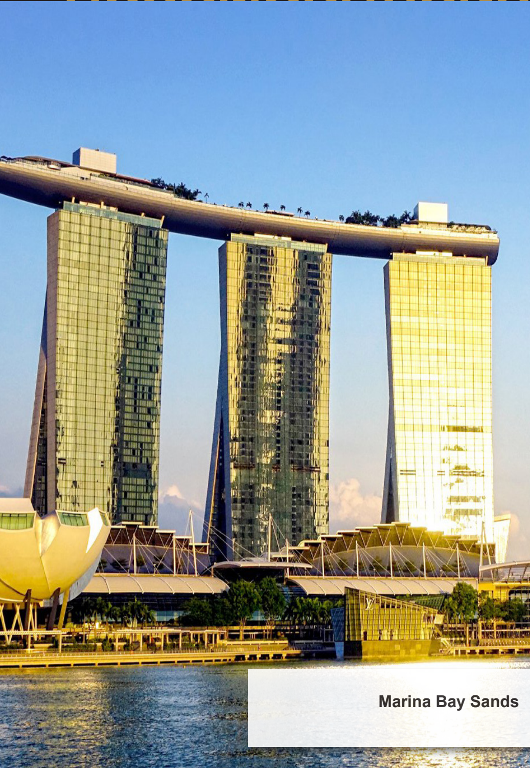
Marina Bay Sands