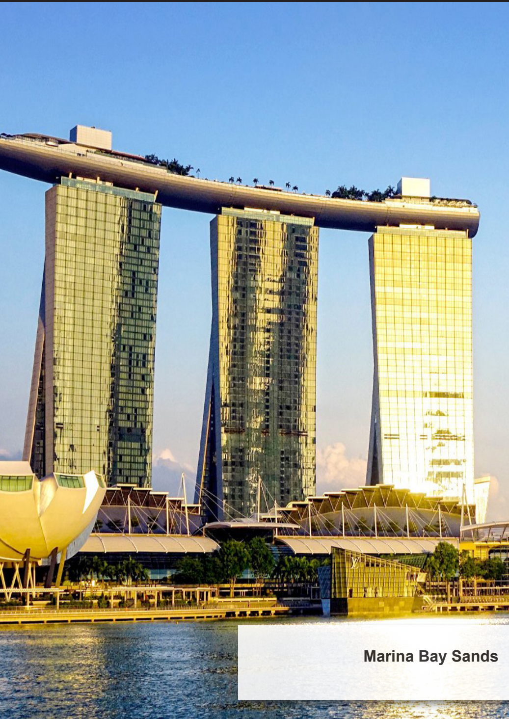
Marina Bay Sands