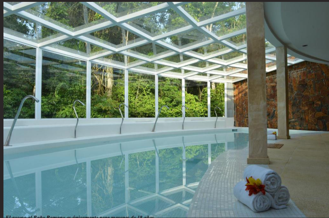
El spa del Baño Romano es únicamente para mayores de 18 años