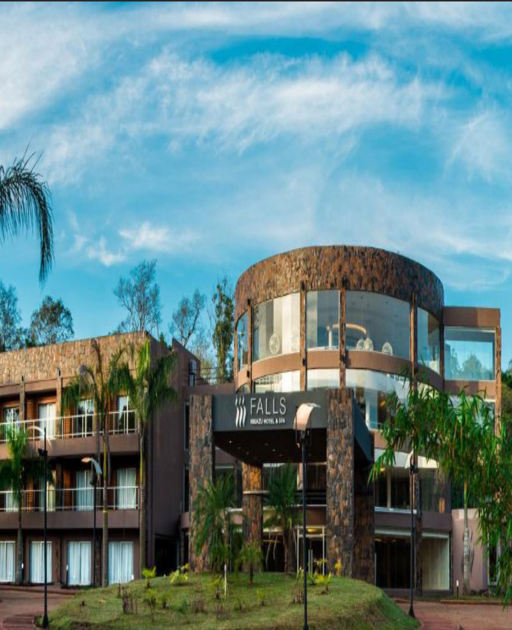
FALLS IGUAZU HOTEL & SPA