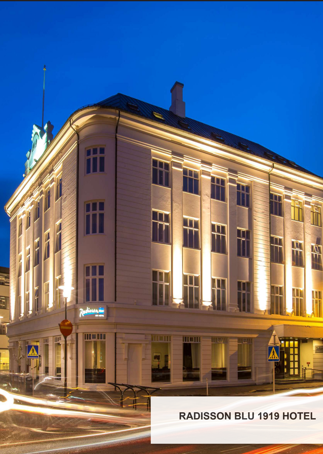
RADISSON BLU 1919 HOTEL