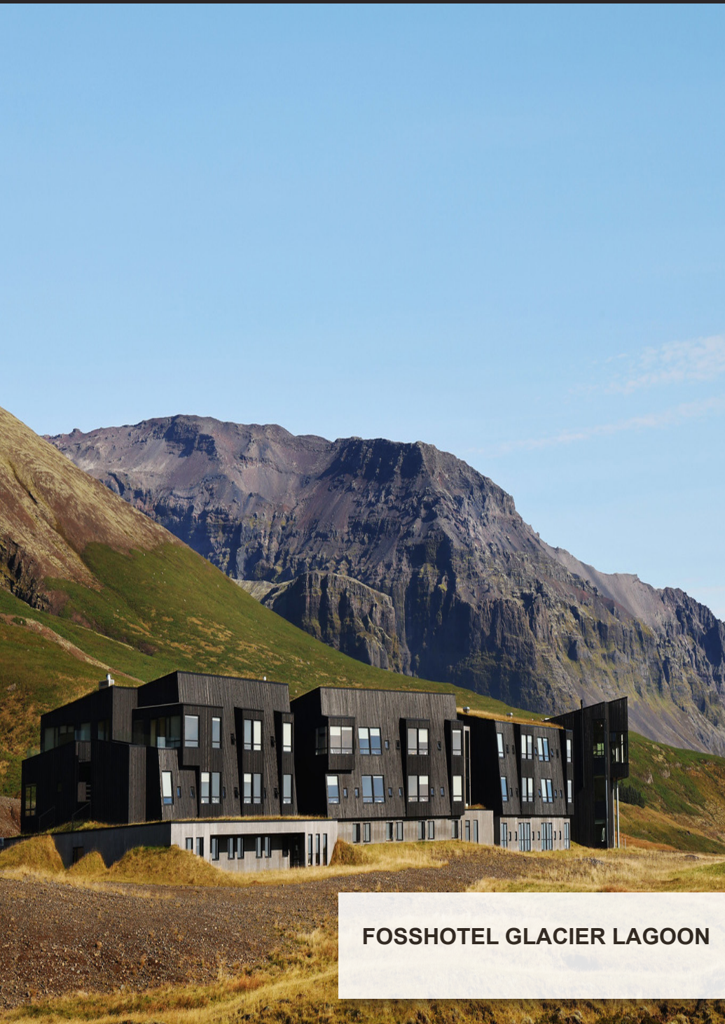
FOSSHOTEL GLACIER LAGOON