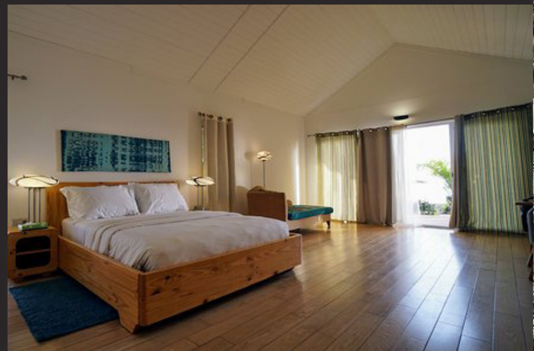
THE PLACE RESORT