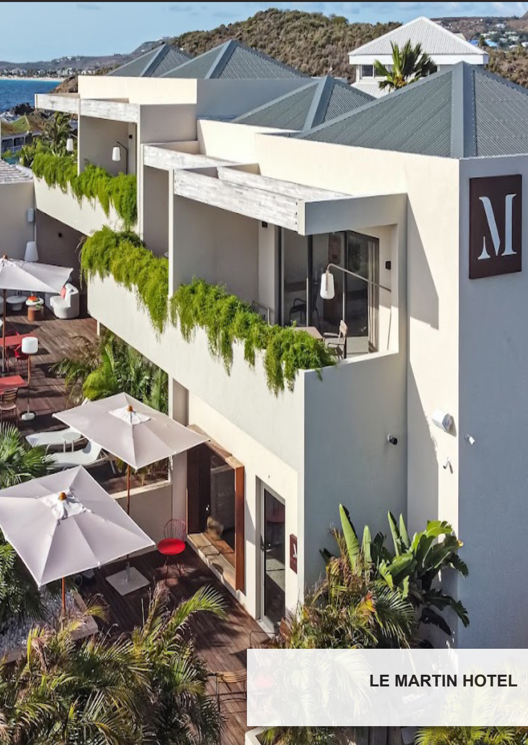
LE MARTIN HOTEL