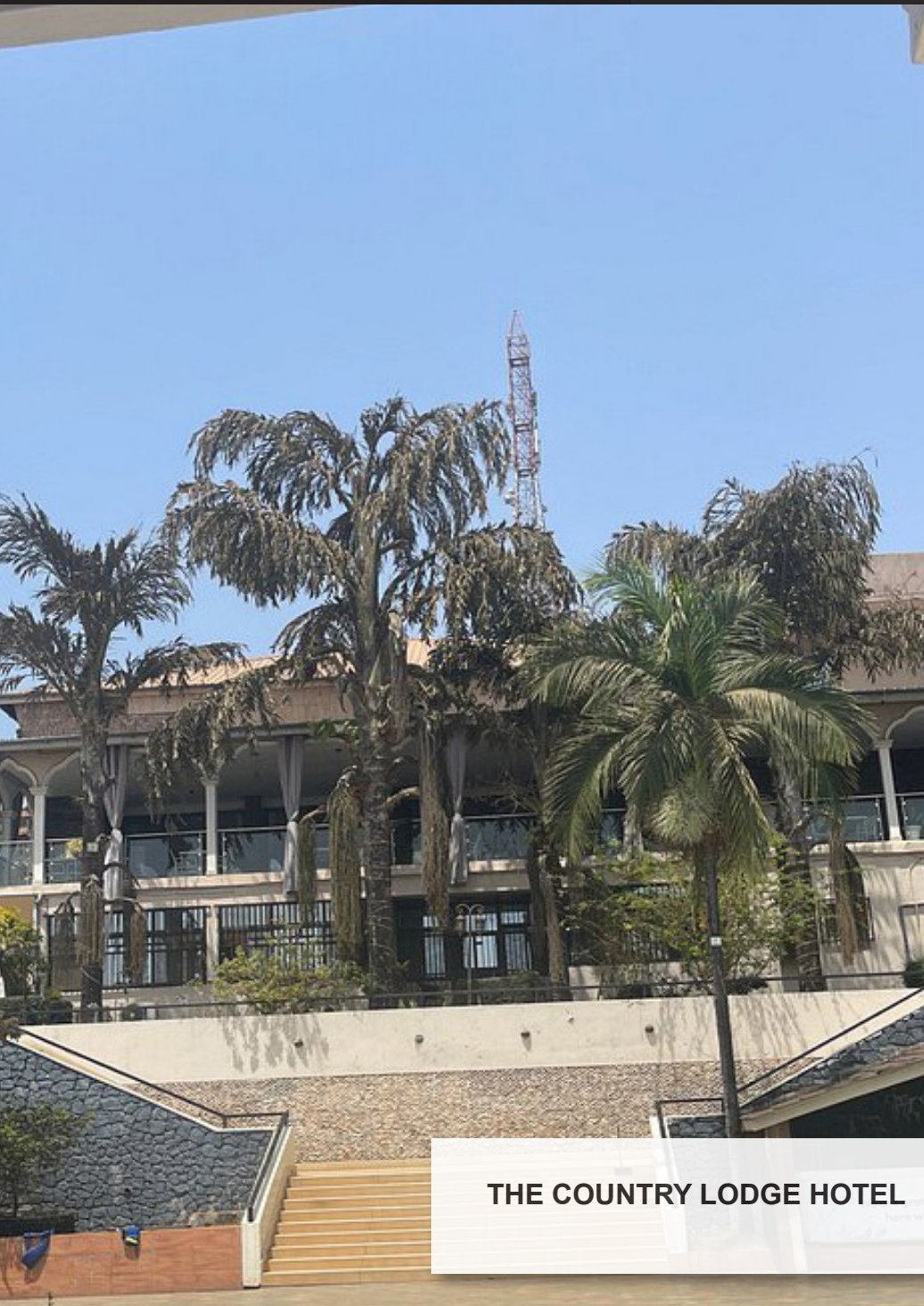
THE COUNTRY LODGE HOTEL