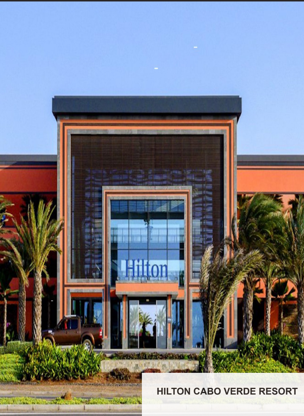
HILTON CABO VERDE RESORT