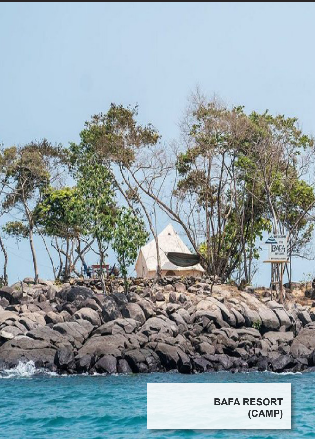
BAFA RESORT (CAMP)